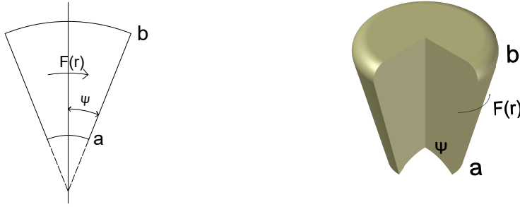
Fig. 1. Geometry of the problem

where w^\bullet = \frac{\partial w(r, \theta)}{\partial \theta} , w' = \frac{\partial w(r, \theta)}{\partial r} , q = \frac{\omega}{c} is the wave number and c = \sqrt{\frac{G}{\rho}} is the shear wave speed, \rho is density and G is the shear modulus.